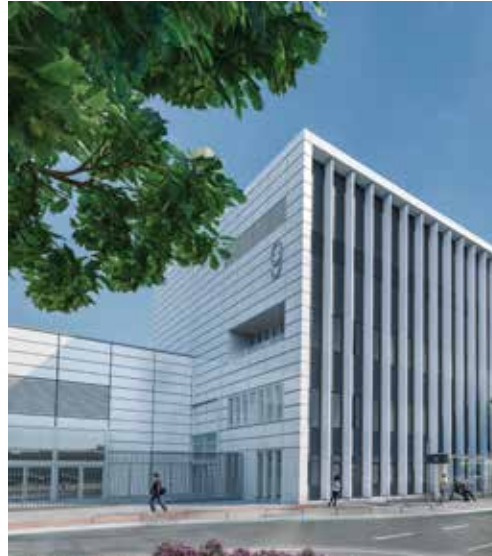
Model of the new hall

This year, a total of 28 trade fairs (of which eleven are guest events) are planned in Düsseldorf.