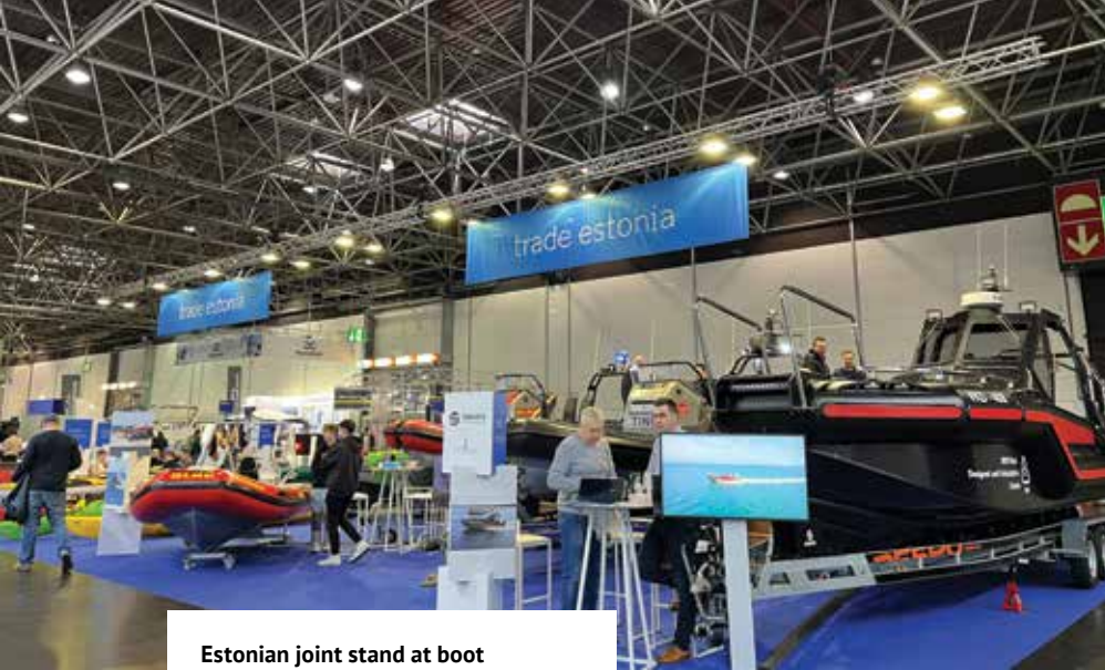
Estonian joint stand at boot