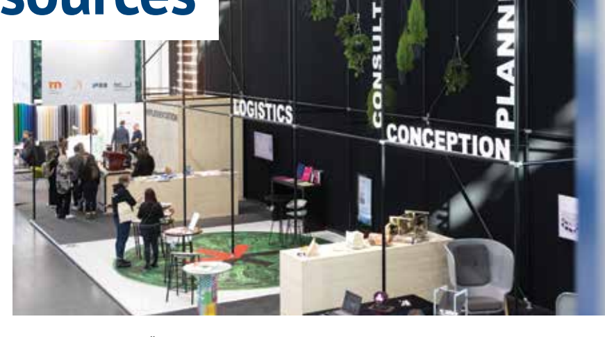
The special stand "THINK SUSTAINABLY - ACT RESPONSIBLY" presented sustainable materials and approaches and was itself an example of a trade fair appearance that is as sustainable as possible.

Messe Düsseldorf recently launched an initiative to promote more sustainable trade fair participation. To this end, it developed a customer guide that includes measures and ideas on how exhibiting companies can make trade fair appearances more sustainable and conserve resources - across all planning phases.